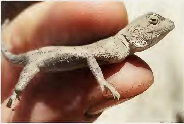
Fig. 20. Agama gracilimembris , Pendjari NP, first rediscovery in Benin after its first description from this country nine decades ago.